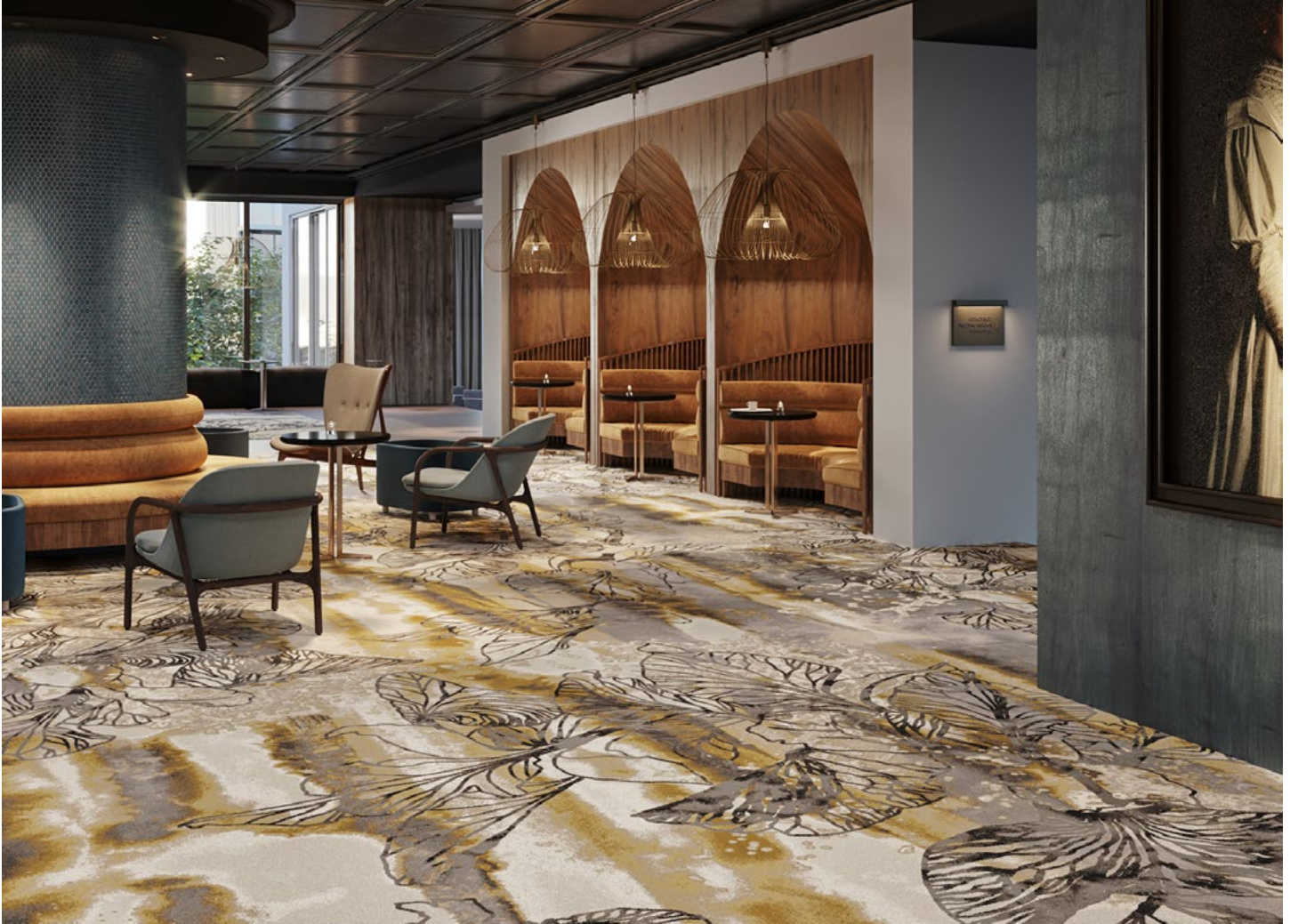
MARIEKE X MA010-1030