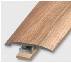
Slim Cap P29

Available to match all Accore™ running line designs