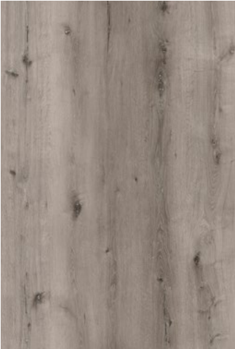
Drift Oak 0013