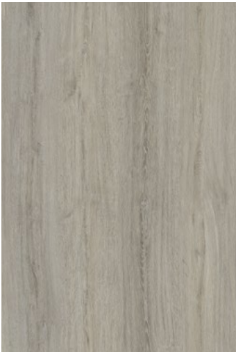
Cerused Oak 0011