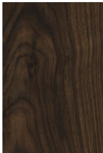
Deep Walnut 0026