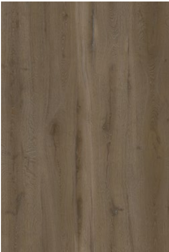
Alder Oak 0007