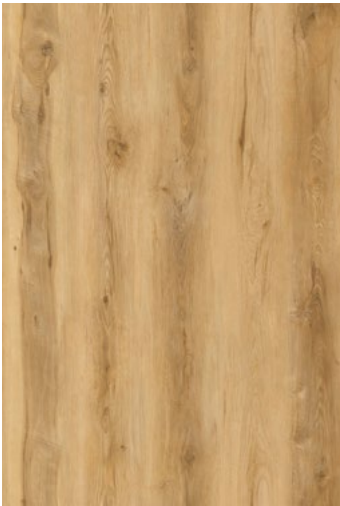
Warm Birch 0006