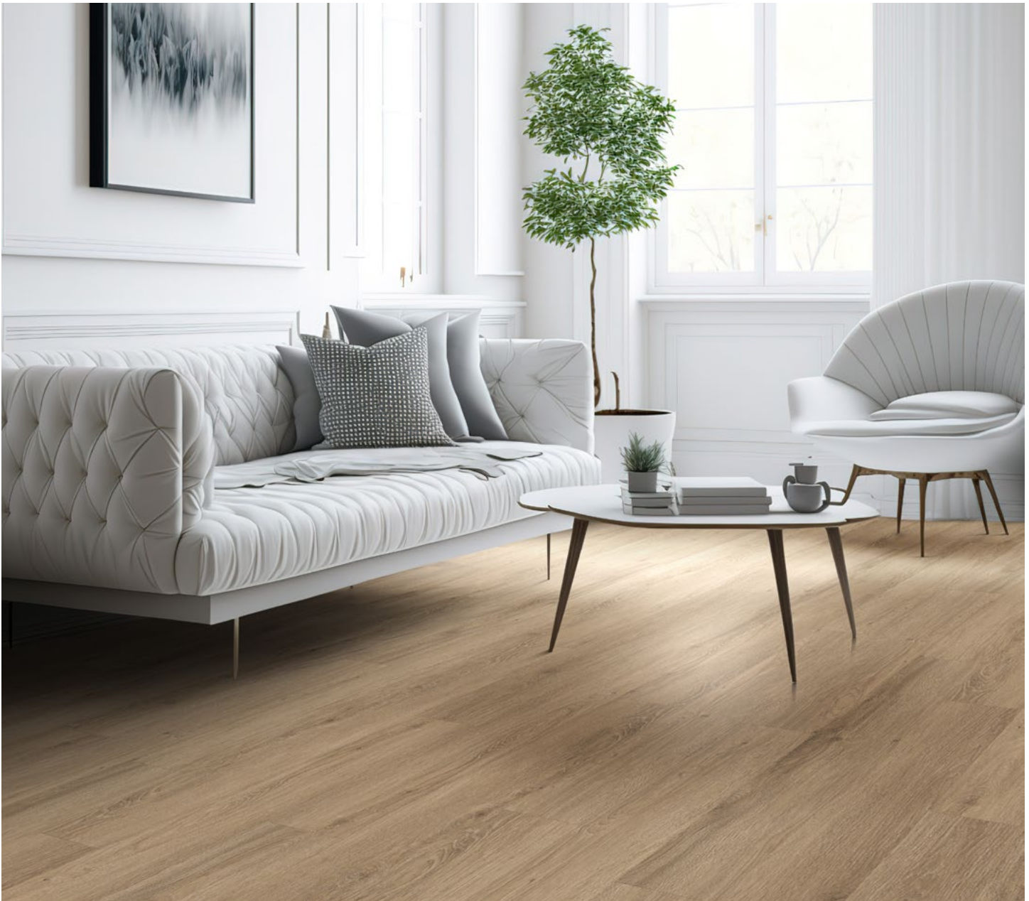
Ashwood Oak 0008