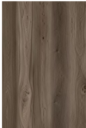
Oxford Elm 0019