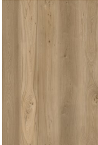
Fawn Elm 0015