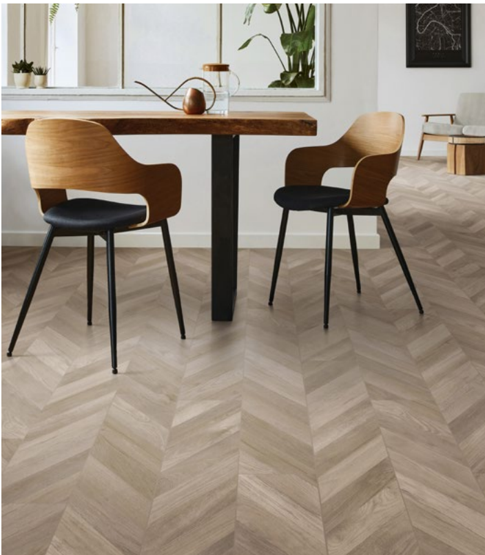
Tawny Chevron 0020