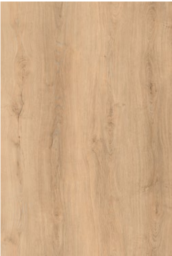
Blush Oak 0009