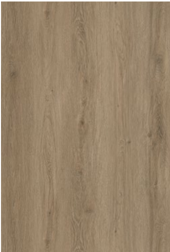
Ashwood Oak 0008