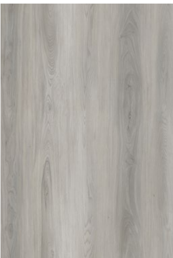
Vale Oak 0021