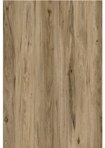
Fumed Hickory 0016