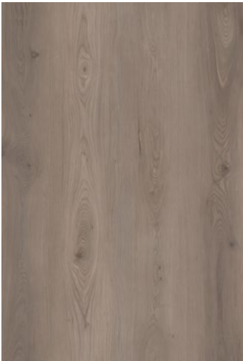
Canyon Elm 0010