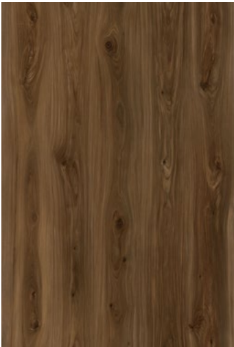
Cocoa Elm 0012