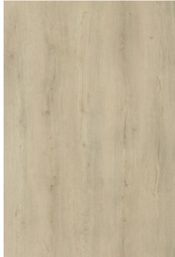
Ecu Oak 0014