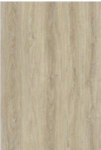
Limed Oak 0017