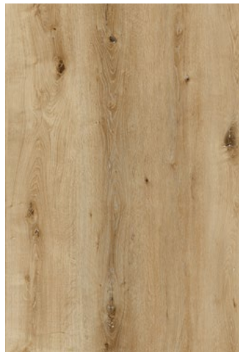
Natural Oak 0018