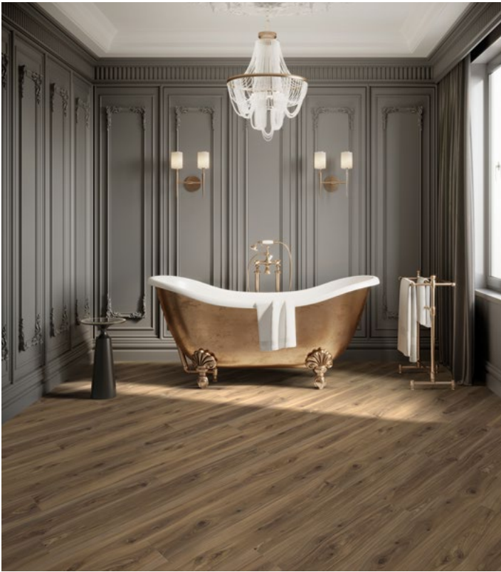
Cocoa Elm 0012