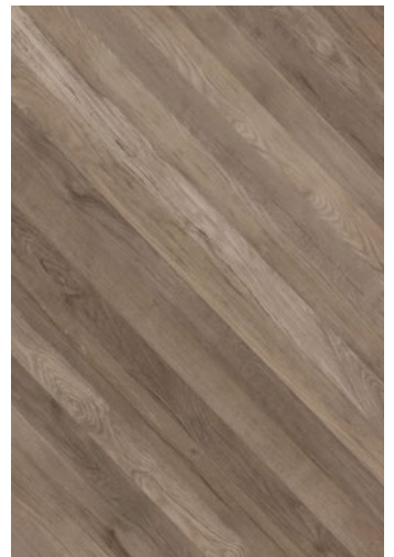
Tawny Chevron 0020