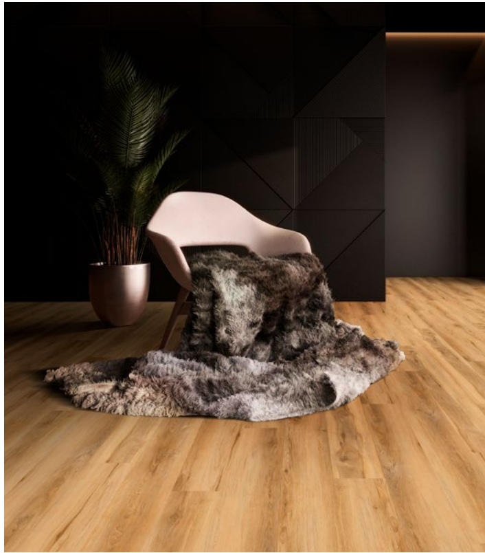
Warm Birch 0006