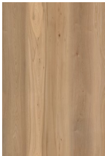
Willow Elm 0022