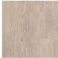
RRW 2503 Artisan Oak