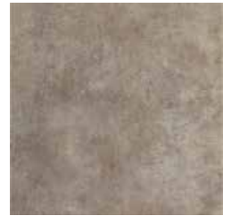
RRS 2509 Riverside