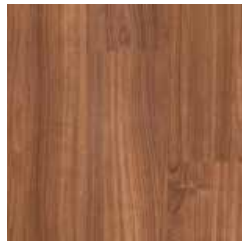
RRW 2500 Heritage Cherry