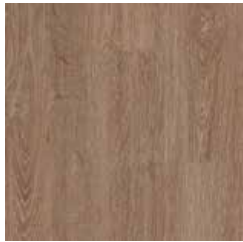
RRW 2505 Ridge Oak