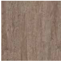
RRW 2504 Timberline