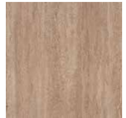
RRS 2509 Tuscan Ivory