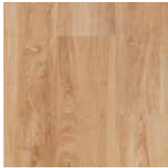
RRW 2501 White Oak