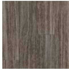
RRW 2506 Weathered Rosewood