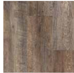
RRW 2502 Nightsgate Tavern